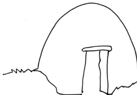
STAGE ① - THE BASIC OVERALL SHAPE

(ii) Add the first details that you notice. The longer you look at it, the more you will see.