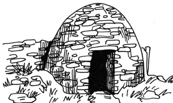
STAGE ③ - SHADOW AND TEXTURE

(iii) Add final detail, any dark parts or shadow. Then look at texture like the grass surrounding the monument, or maybe gravel and stones.